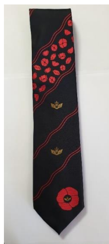
Poppy Tie 30.00 ea.