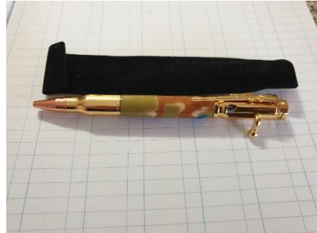
Rifle Pen $20.00 ea.