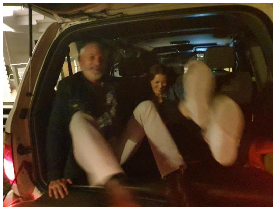
Two people, who are to remain nameless, trying to get out of a vehicle.