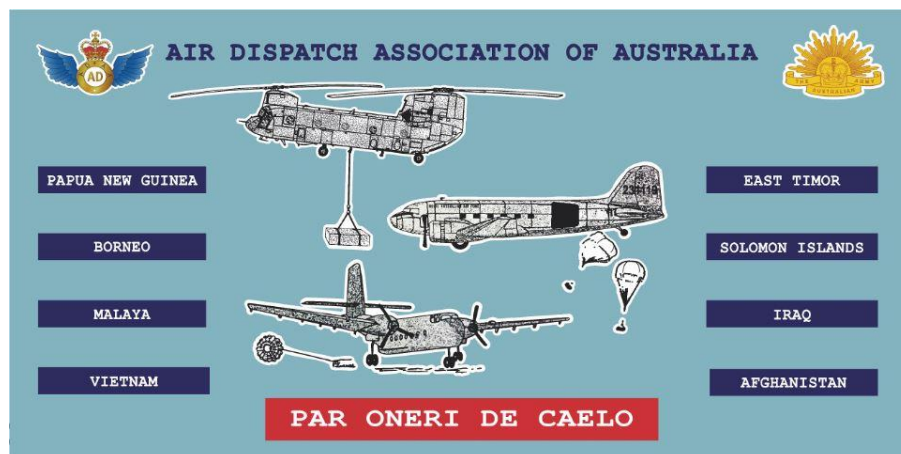
Our new ADAA Banner

Until next time, Please stay safe Cheers Nicko