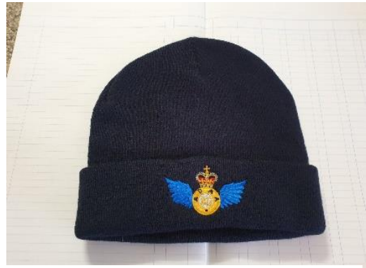
Beanie - Black or Navy $20.00 ea