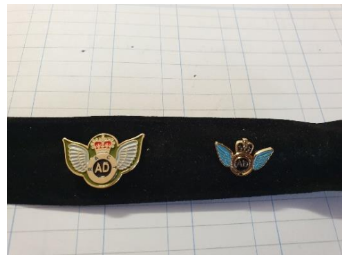
Brevet Badge Large $10.00 ea.