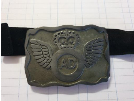
Belt Buckle $28.00 ea.