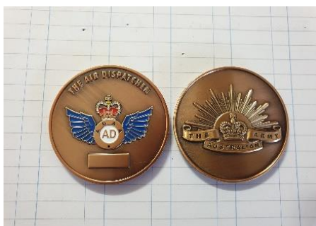
The Air Dispatcher Coin $26.00 ea.