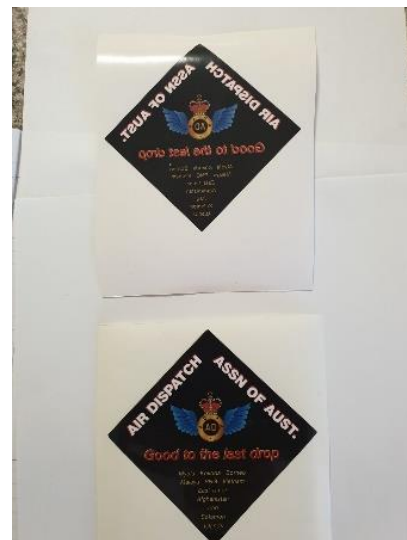
ADAA Sticker $3.00 ea.