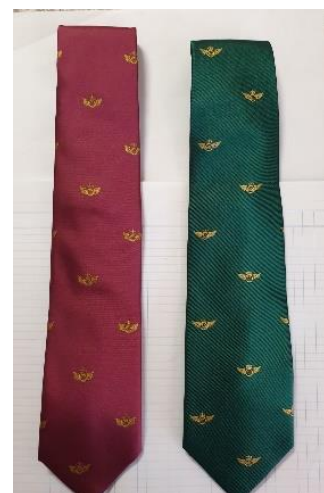
Brevet Tie 28.00 ea.