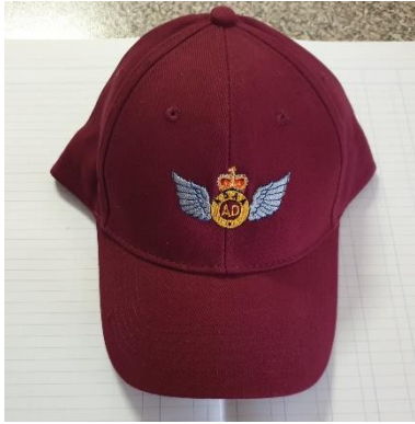
Brevet Cap $18.00 ea

For all your merchandise needs please check out our website shop or contact Rusty Towers (see last page for contact details).