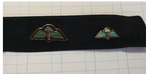
Parra Badge Large $10.00 ea.