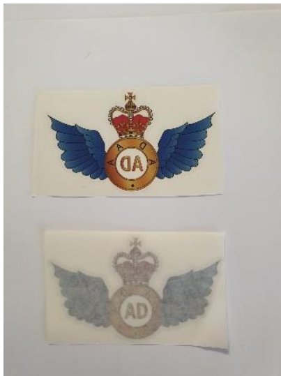
Brevet Sticker $3.00 ea.