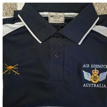
Shirt - Maroon or Navy $35.00 ea.